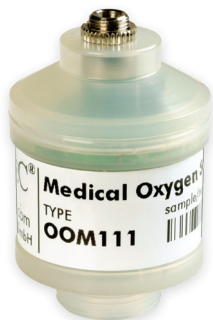
Oxygen Sensor: OOM111