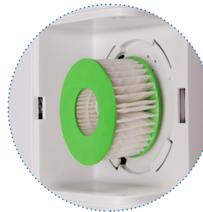
Air filter (Located behind the cover)